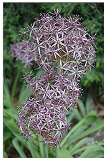
Star Of Persia Onion flowers