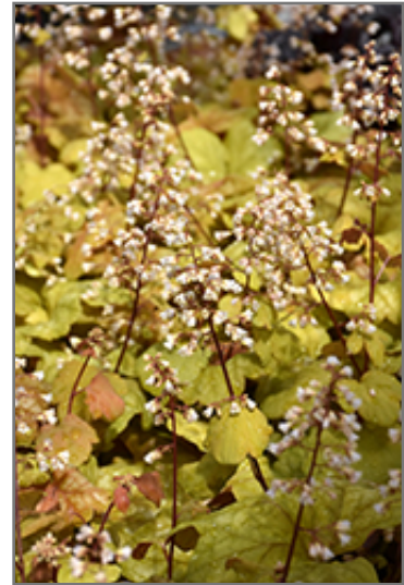
Champagne Coral Bells flowers