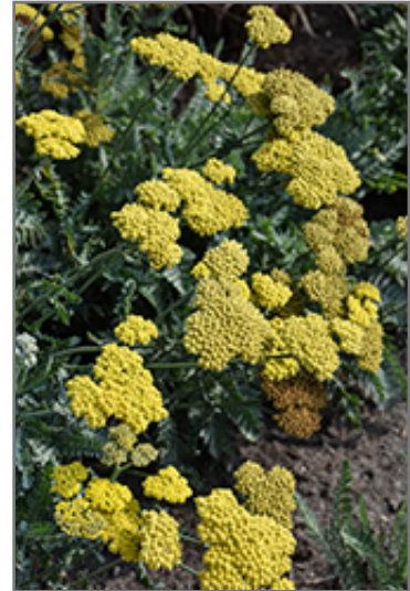
Moonshine Yarrow flowers

Moonshine Yarrow will grow to be about 24 inches tall at maturity, with a spread of 24 inches. It grows at a fast rate, and under ideal conditions can be expected to live for approximately 10 years. As an herbaceous perennial, this plant will usually die back to the crown each winter, and will regrow from the base each spring. Be careful not to disturb the crown in late winter when it may not be readily seen!