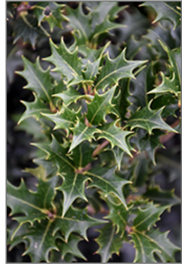
Gulftide False Holly foliage

Gulftide False Holly is recommended for the following landscape applications;