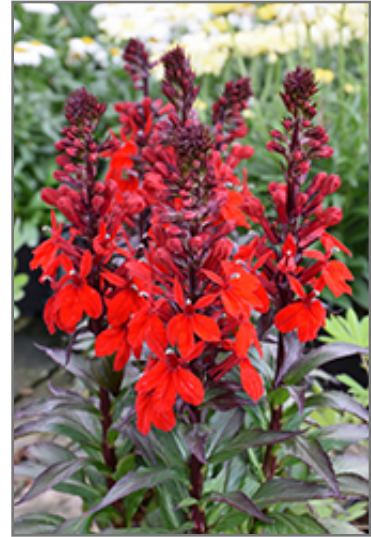
Starship Scarlet Lobelia flowers

Starship Scarlet Lobelia is recommended for the following landscape applications;