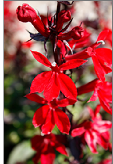
Starship Scarlet Lobelia flowers

Starship Scarlet Lobelia is a fine choice for the garden, but it is also a good selection for planting in outdoor pots and containers. With its upright habit of growth, it is best suited for use as a 'thriller' in the 'spiller-thriller-filler' container combination; plant it near the center of the pot, surrounded by smaller plants and those that spill over the edges. Note that when growing plants in outdoor containers and baskets, they may require more frequent waterings than they would in the yard or garden.