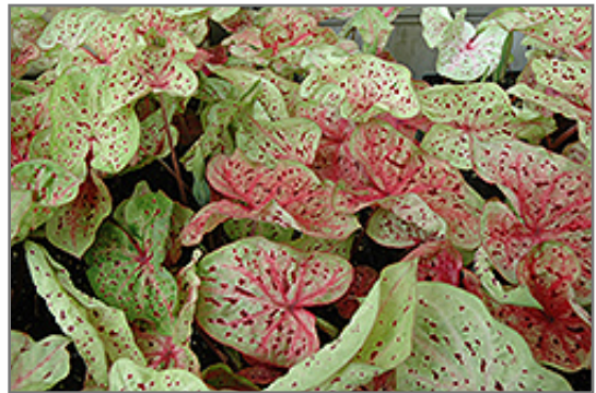
Miss Muffet Caladium foliage