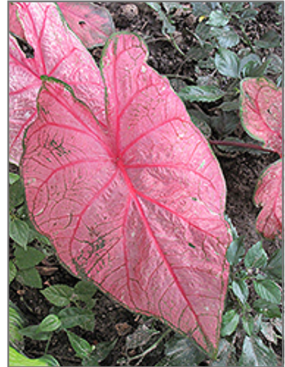
Fannie Munson Caladium foliage

Fannie Munson Caladium is recommended for the following landscape applications;