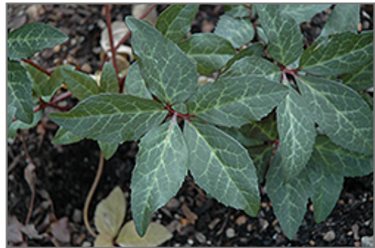
Merlin Hellebore foliage