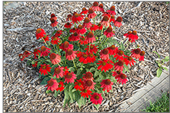
Sombrero Salsa Red Coneflower in bloom

Sombrero Salsa Red Coneflower will grow to be about 16 inches tall at maturity extending to 24 inches tall with the flowers, with a spread of 24 inches. Its foliage tends to remain dense right to the ground, not requiring facer plants in front. It grows at a medium rate, and under ideal conditions can be expected to live for approximately 10 years. As an herbaceous perennial, this plant will usually die back to the crown each winter, and will regrow from the base each spring. Be careful not to disturb the crown in late winter when it may not be readily seen!