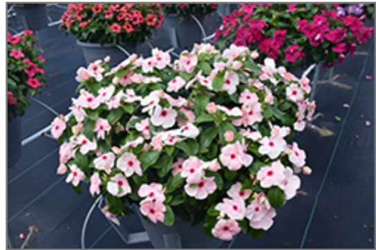
Titan Apricot Vinca in bloom