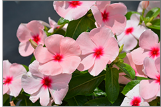
Titan Apricot Vinca flowers

Titan Apricot Vinca is recommended for the following landscape applications;