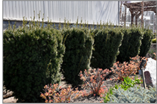
Hicks Yew

This shrub performs well in both full sun and full shade. However, you may want to keep it away from hot, dry locations that receive direct afternoon sun or which get reflected sunlight, such as against the south side of a white wall. It does best in average to evenly moist conditions, but will not tolerate standing water. It is not particular as to soil type or pH. It is highly tolerant of urban pollution and will even thrive in inner city environments, and will benefit from being planted in a relatively sheltered location. Consider applying a thick mulch around the root zone in winter to protect it in exposed locations or colder microclimates. This particular variety is an interspecific hybrid, and parts of it are known to be toxic to humans and animals, so care should be exercised in planting it around children and pets.