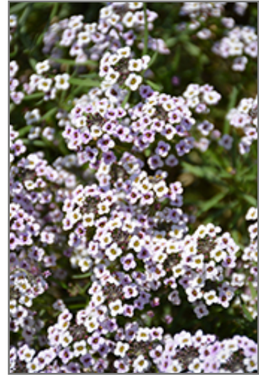
Blushing Princess Sweet Alyssum flowers

This plant will require occasional maintenance and upkeep, and should not require much pruning, except when necessary, such as to remove dieback. It is a good choice for attracting bees and butterflies to your yard, but is not particularly attractive to deer who tend to leave it alone in favor of tastier treats. It has no significant negative characteristics.