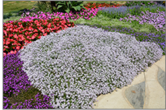
Blushing Princess Sweet Alyssum in bloom

Blushing Princess Sweet Alyssum is a fine choice for the garden, but it is also a good selection for planting in hanging baskets. Because of its trailing habit of growth, it is ideally suited for use as a 'spiller' in the 'spiller-thriller-filler' container combination; plant it near the edges where it can spill gracefully over the pot. Note that when growing plants in outdoor containers and baskets, they may require more frequent waterings than they would in the yard or garden.