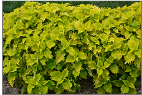
Wasabi Coleus