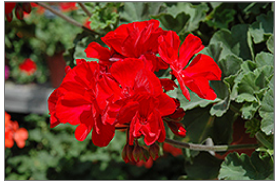
Fantasia Dark Red Geranium flowers