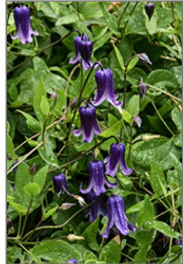
Rooguchi Clematis flowers