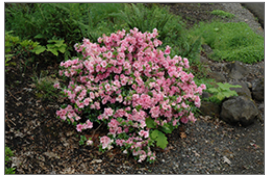
Gumpo Pink Azalea in bloom