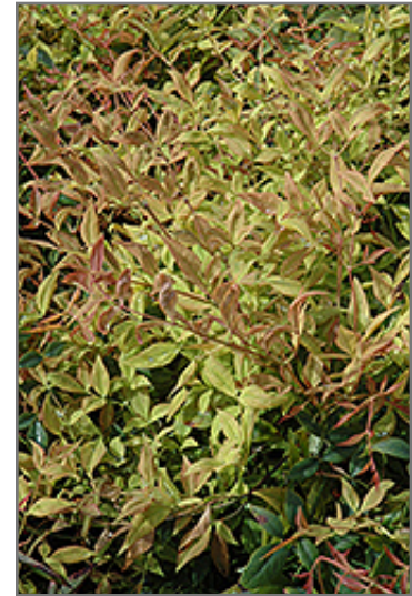
Gulf Stream Dwarf Nandina foliage