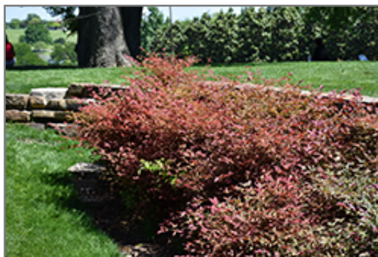
Flirt Nandina

Flirt Nandina is recommended for the following landscape applications;