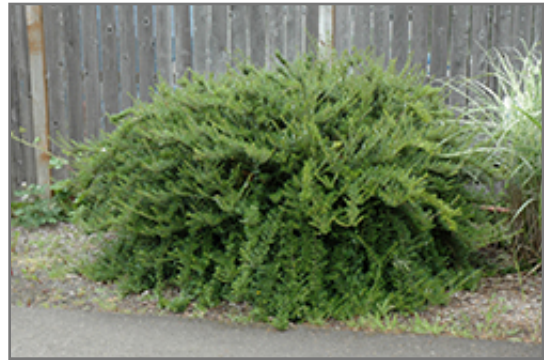
Box Honeysuckle

Box Honeysuckle is recommended for the following landscape applications;