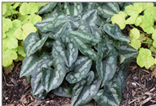
Asian Wild Ginger