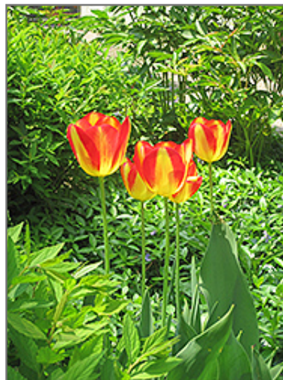
Antoinette Tulip in bloom