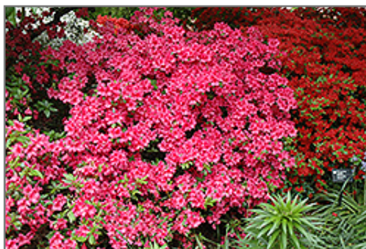
Girard's Rose Azalea in bloom