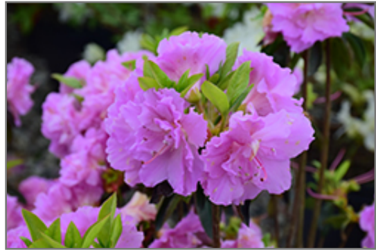
Elsie Lee Azalea flowers