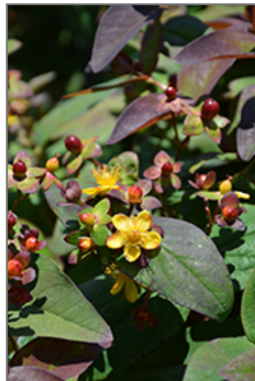
Albury Purple St. John's Wort flowers