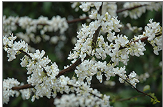
White Redbud flowers