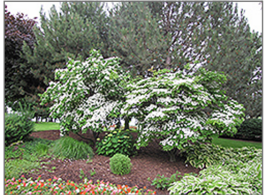
Chinese Dogwood in bloom