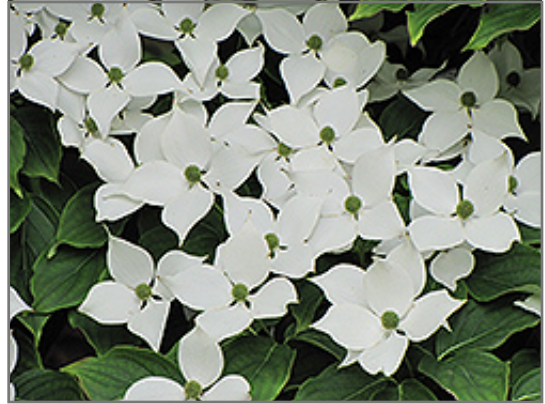
Chinese Dogwood flowers