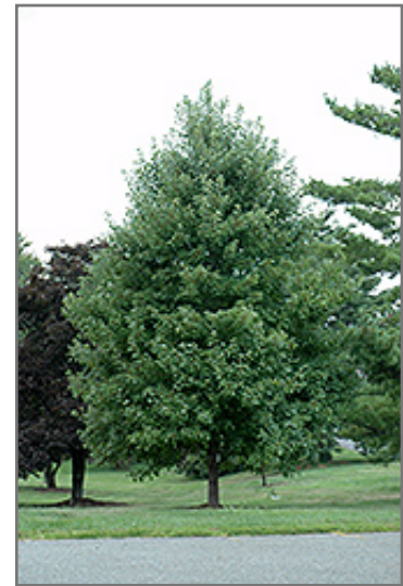
October Glory Red Maple