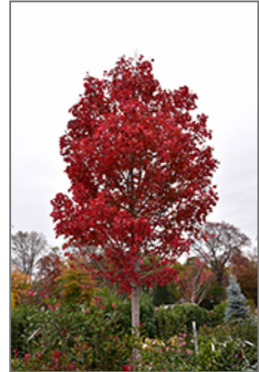
October Glory Red Maple in fall