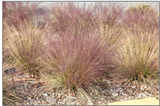
Hairawn Muhly in fall