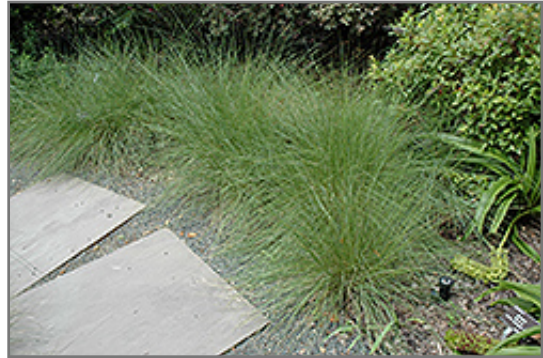
Hairawn Muhly

Hairawn Muhly is recommended for the following landscape applications;