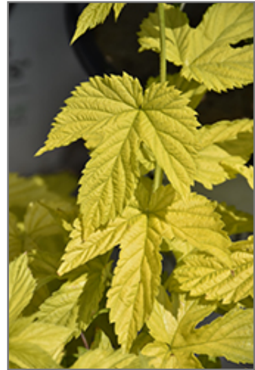
Golden Hops foliage