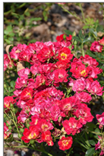
Pink Drift Rose flowers

Pink Drift Rose is recommended for the following landscape applications;