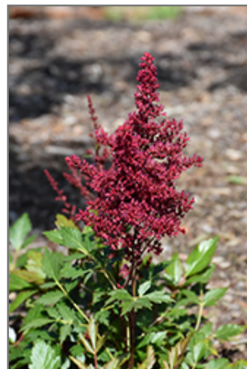
Red Sentinel Astilbe flowers

Red Sentinel Astilbe is a fine choice for the garden, but it is also a good selection for planting in outdoor pots and containers. With its upright habit of growth, it is best suited for use as a 'thriller' in the 'spiller-thriller-filler' container combination; plant it near the center of the pot, surrounded by smaller plants and those that spill over the edges. Note that when growing plants in outdoor containers and baskets, they may require more frequent waterings than they would in the yard or garden.