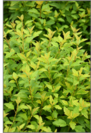
Raspberry Lemonade Ninebark foliage

Raspberry Lemonade Ninebark is recommended for the following landscape applications;