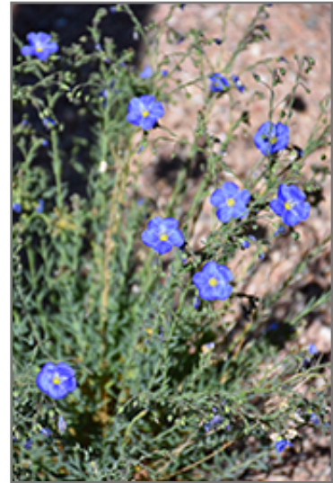
Wild Blue Flax flowers