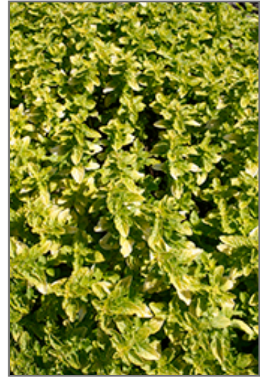
Drops of Jupiter Oregano foliage

Drops of Jupiter Oregano is a fine choice for the garden, but it is also a good selection for planting in outdoor pots and containers. It can be used either as 'filler' or as a 'thriller' in the 'spiller-thriller-filler' container combination, depending on the height and form of the other plants used in the container planting. It is even sizeable enough that it can be grown alone in a suitable container. Note that when growing plants in outdoor containers and baskets, they may require more frequent waterings than they would in the yard or garden.