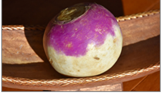
Purple Top White Globe Turnip fruit

Landscape Design | Build | Maintain 301-762-6301