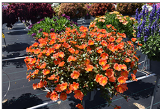
Mega Pazzaz Orange Portulaca in bloom