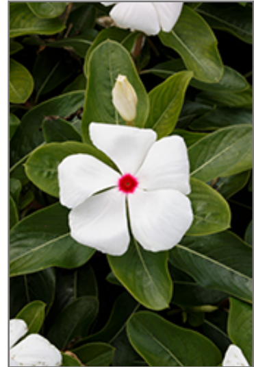
Cora Cascade Polka Dot Vinca flowers

Cora Cascade Polka Dot Vinca is recommended for the following landscape applications;