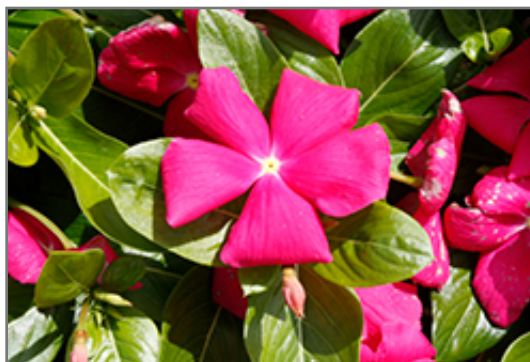
Cora Cascade Bright Rose Vinca flowers

Cora Cascade Bright Rose Vinca is recommended for the following landscape applications;