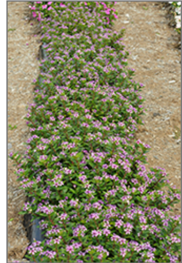
Soiree Kawaii Blueberry Kiss Vinca in bloom

Soiree Kawaii Blueberry Kiss Vinca will grow to be about 10 inches tall at maturity, with a spread of 18 inches. Its foliage tends to remain low and dense right to the ground. Although it's not a true annual, this fast-growing plant can be expected to behave as an annual in our climate if left outdoors over the winter, usually needing replacement the following year. As such, gardeners should take into consideration that it will perform differently than it would in its native habitat.