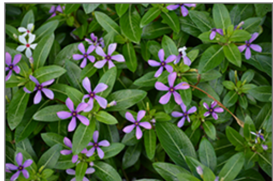
Soiree Kawaii Blueberry Kiss Vinca flowers