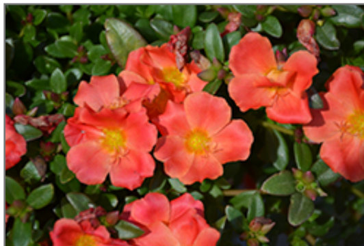
Pazzaz Orange Flare Portulaca flowers

Pazzaz Orange Flare Portulaca is recommended for the following landscape applications;