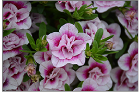
MiniFamous Uno Double PinkTastic Calibrachoa flowers

MiniFamous Uno Double PinkTastic Calibrachoa is a dense herbaceous annual with a trailing habit of growth, eventually spilling over the edges of hanging baskets and containers. Its medium texture blends into the garden, but can always be balanced by a couple of finer or coarser plants for an effective composition.