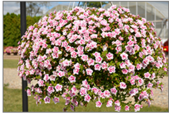
MiniFamous Uno Double PinkTastic Calibrachoa in bloom