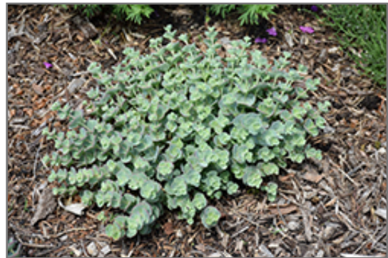
Dwarf October Daphne