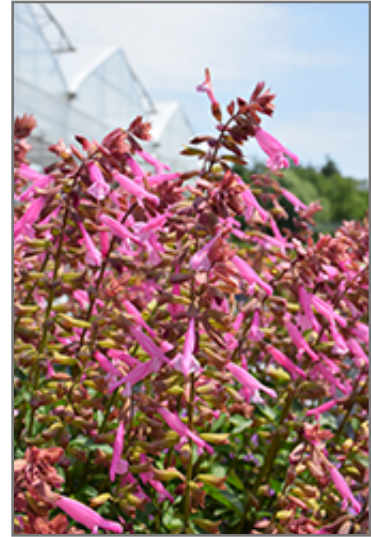
Skyscraper Pink Salvia flowers

Skyscraper Pink Salvia is an herbaceous perennial with an upright spreading habit of growth. Its relatively fine texture sets it apart from other garden plants with less refined foliage.