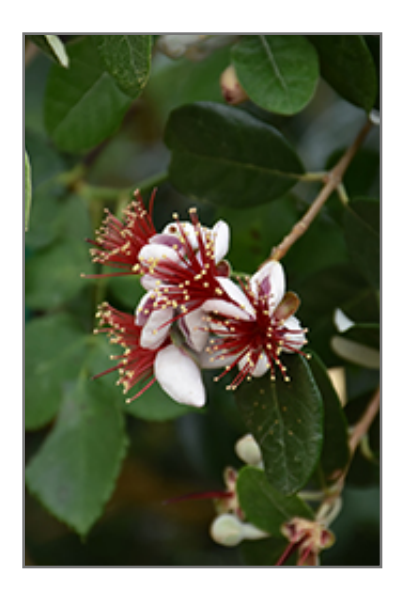
Pineapple Guava flowers