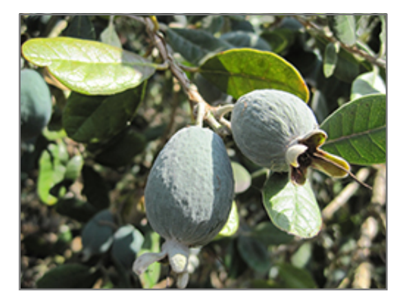
Pineapple Guava fruit

Pineapple Guava features showy white pincushion flowers with pink overtones and red anthers at the ends of the branches from late spring to early summer. It has green foliage with gray undersides. The glossy oval pinnately compound leaves remain green throughout the winter. The fruits are showy green drupes carried in abundance from early summer to mid fall.