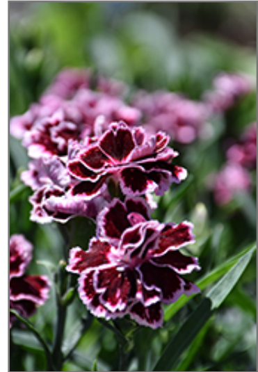
Odessa Pierrot Pinks flowers

Odessa Pierrot Pinks is recommended for the following landscape applications;