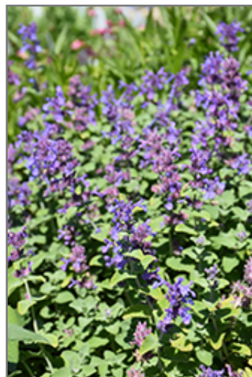
Early Bird Catmint flowers

Early Bird Catmint is recommended for the following landscape applications;