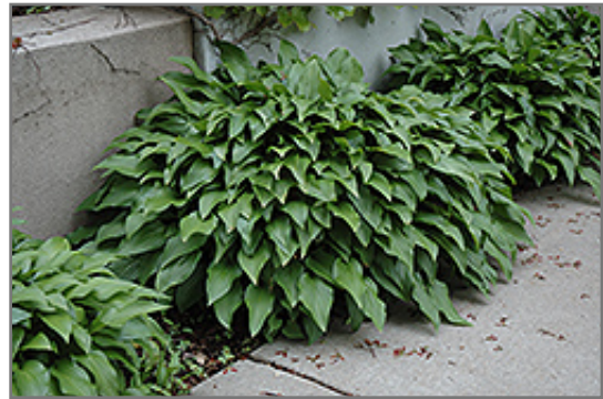
Invincible Hosta

Invincible Hosta is recommended for the following landscape applications;