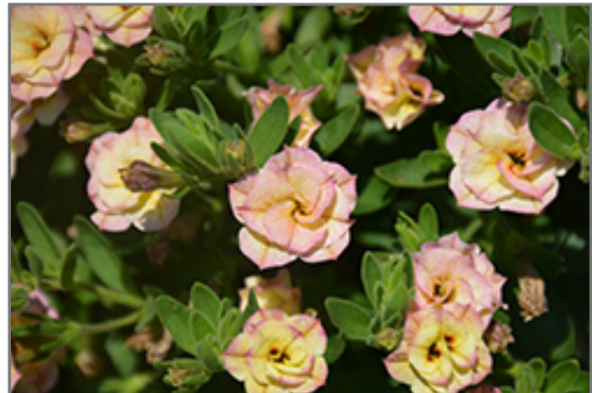
MiniFamous Double Compact Rose Chai Calibrachoa flowers

MiniFamous Double Compact Rose Chai Calibrachoa is recommended for the following landscape applications;