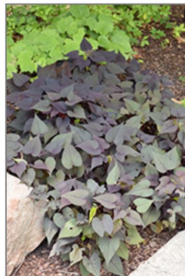
Sweet Georgia Heart Purple Sweet Potato Vine