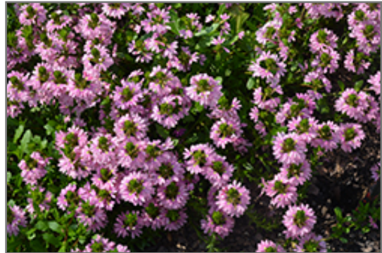
Whirlwind Pink Fan Flower flowers